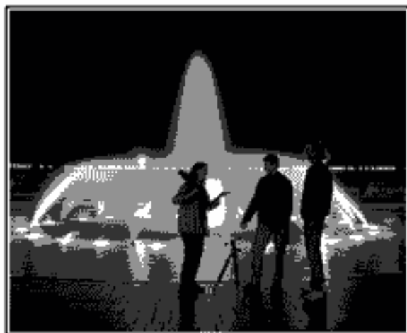
SCPS Members enjoying some night photography in Balboa Park

The Ordovery Gallery at Solana Beach Icons of the 50's and 60's: Historic Black & White Photography of Leigh Wiener (1929 - 1993) January 13 through April 12, 2009 410 S. Cedros, Solana Beach (858) 720-1121